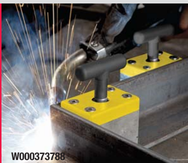
Fabricate angles quickly; pull corners together with hold on multiple sides.