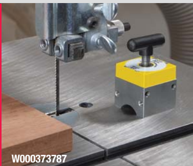
Use as a stop. Mounts anywhere.

Welders and Fabricators are raving about all the uses, convenience and time savings with MAGSWITCH MagSquares. MagSquares are extremely powerful on off magnetic blocks with strong holding force available on all sides. Welders have never enjoyed this complete control over incredibly strong magnets. You can precisely position the MagSquare and material, and then turn the magnet on. MagSquares feature multi-plane workholding capability. Takes away the need for time consuming manual clamping on so many jobs - and works anywhere there is steel. You don't need an edge like you do with C-Clamps. All Mag-Squares are machined at 90 degrees, have pre-tapped holes on all sides for mounting tools, jigs and fixtures. Fast 180 degree turn of the knob turns the MagSquare on and off. When off, nothing sticks to them. Once you understand all the uses, the time savings in set ups, and the ability to control these powerful magnetic blocks - you will want the entire range.