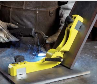
Pivot range for angles from 22 to 270 degrees.