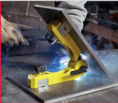
Each axis magnet holds on two sides.

MAGSWITCH Pivot Angle offers a range of angles from 22 to 270 degrees. Each axis features a MAGSWITCH with a 200 lb (90 kg) hold capability. A single pivot point is located on the elbow. The elbow joint locks and unlocks quickly with a lever. The dial on the elbow features indicators every 5 degrees. On each axis MAGSWITCH is exposed on a side to enable the tool to secure to a table or wall, while simultaneously holding the work piece. Perfect for repetitive work on uncommon angles.