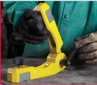
Single lock on elbow for fast securing of your angle.