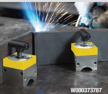
Align two pieces of steel - flat or round.