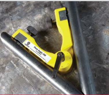
Accommodates flat and pipe.