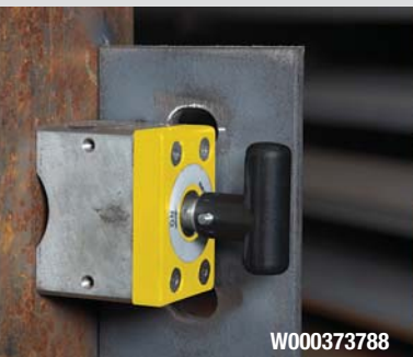
Fast 90 degree angles.